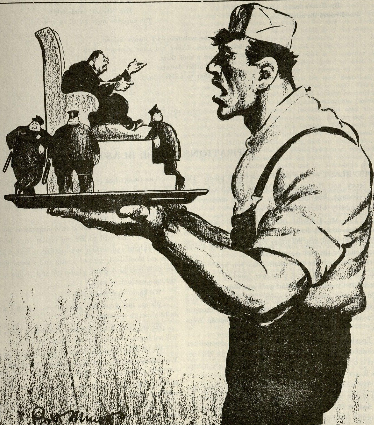
"THE COURT ORDERS—"