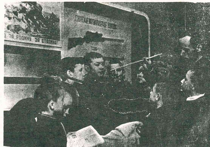
A SENIOR KOMSOMOL LEADER EXPLAINS TO A GROUP OF YOUNG PIONEERS THE OPERATION OF A MODEL T-34 PANZER TANK

We suggest that this price list be used as an order blank. Merely circle the desired items. We will enclose another catalogue with each order. We bear all mailing costs, and try to keep prices as low as feasible. In order to maintain our activities, however, we earnestly solicit any voluntary overpayments.