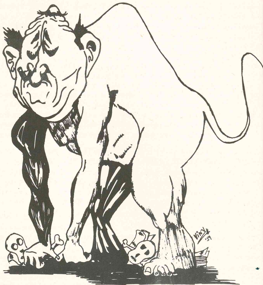
HERO TYPE #2: Wall Street Executive, 1959--the final evolution of the animal kingdom.

The petitions and the visit to the White House are but formal gestures—a publicity gimmick at best. If the people ever to get anything they will have to take it.